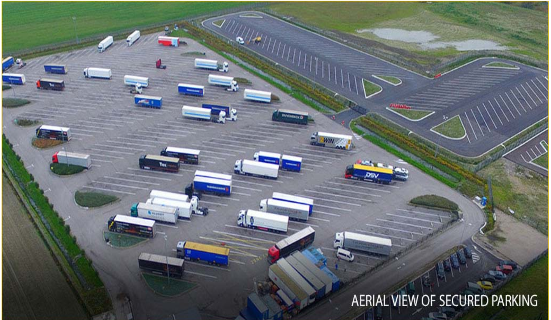
AERIAL VIEW OF SECURED PARKING