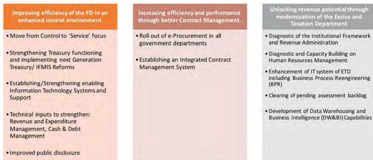
Figure 1. Program Pillars

24. The Government’s PFM Reform Program has been approved by the cabinet and (in context of the proposed financial support from the World Bank) has been endorsed by the Chief Minister in the budget speech for the year 2016–17, indicating the Government’s intent and ownership of the program.