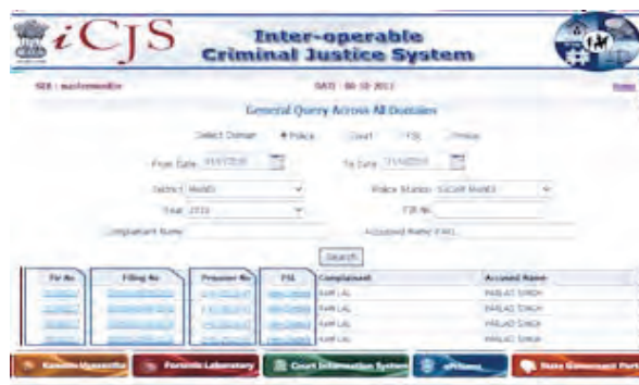
Figure 1: iCJS software at http://admis.hp.nic.in/cjs

The basic objective of the Inter-operable Criminal Justice System has been faster delivery of justice to the litigants in view of the large number of criminal cases pending in various Courts. The reasons for such delays are numerous, the most common being, besides the lack of resources and manpower constraints, the delayed and in-complete transfer of information from Police to Courts, Forensics to Police, Police to Prison, Court to Prison, Prosecution to Court and vice-versa in all cases. The Police, Forensic Science Laboratories, Prosecution, Courts and Prisons are the major stakeholders in the process of delivery of criminal justice in our country.