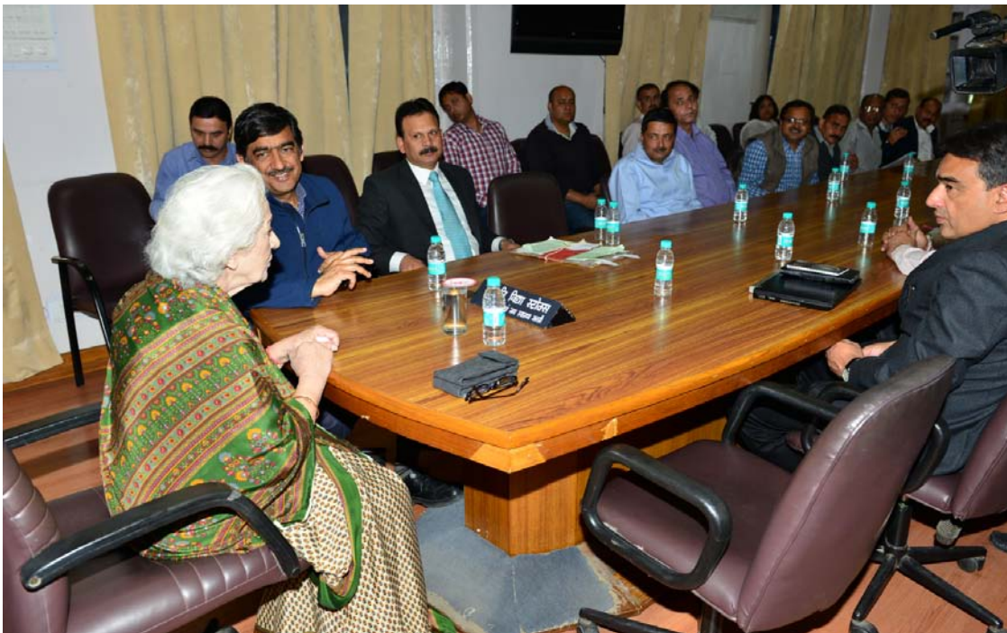
Smt. Vidya Stokes, Information Technology Minister, Himachal Pradesh speaking during the launch ceremony

Speaking on the occasion, Smt. Stokes said that the Information Technology Department has set up about 600 Aadhaar Enrolment Centres across the State for enrolment coverage. She said that for effective monitoring of enrolment in these Centres, a Mobile application has been developed by the Department of IT which is for the internal use of all Aadhaar Enrolment Centres working in Himachal Pradesh. It enables authorized users to upload the data of number of enrolments done in their respective centres, she added.