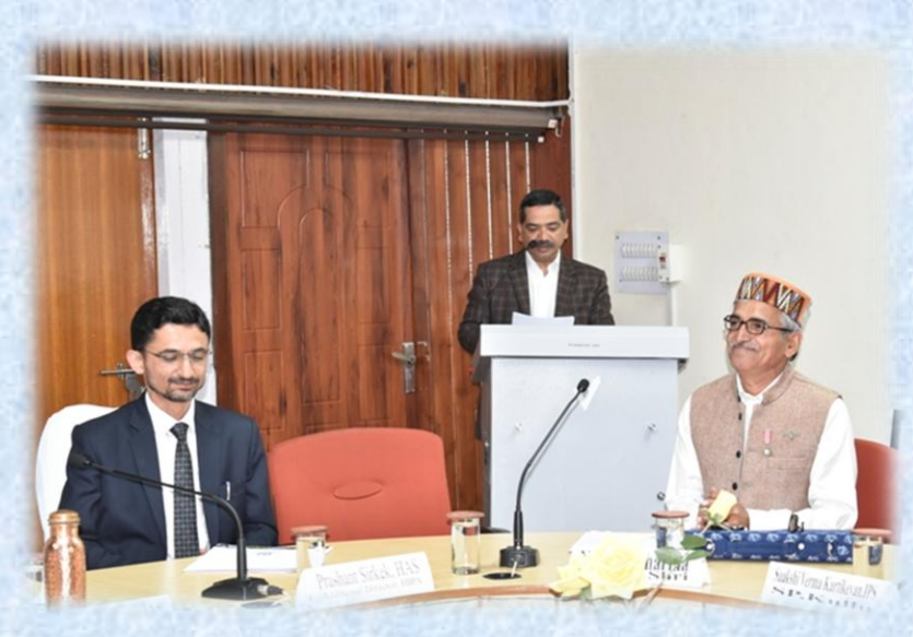
Opening remarks by Director General, HIPA-cum-Chairperson CBC