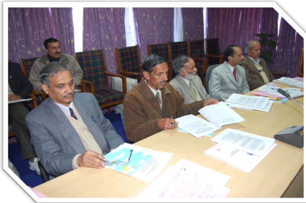
Participants in the training programme