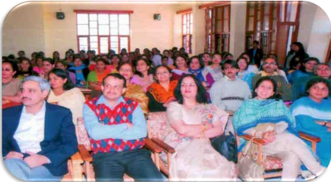
Students and staff members of RKMV, Shimla keenly listening to the speakers on the occasion.