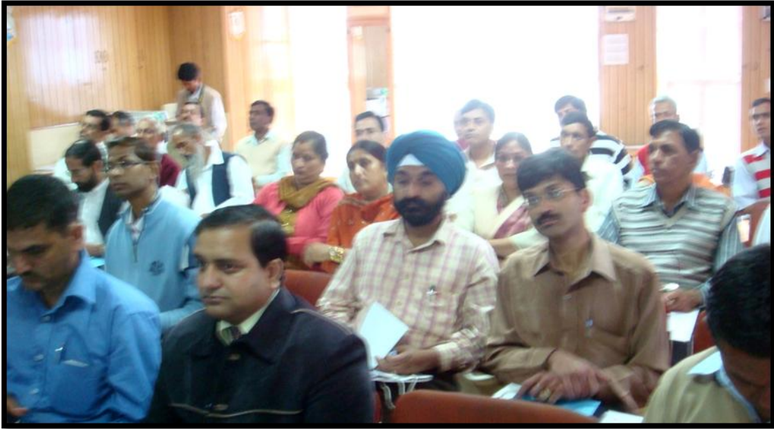
Municipal Councillors and Officers engrossed in the Workshop deliberations

Emphasis was laid on the practical application of the RTI Act 2005 and the august gathering was advised to effect changes in the colonial mindset which hinders the smooth operation of RTI Act.