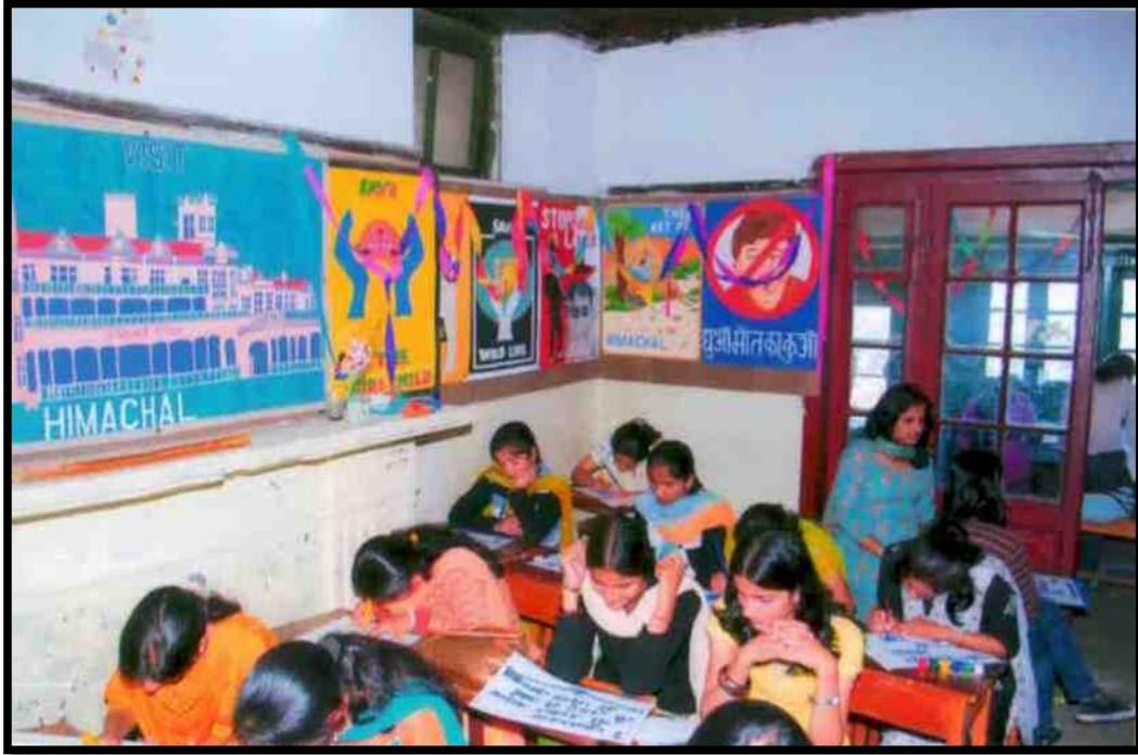
Students at work in Slogan writing on RTI

and Training to the government of Himachal Pradesh., keenly took note of the views of students on Right to Information and added new details on the Right to Information for their knowledge.