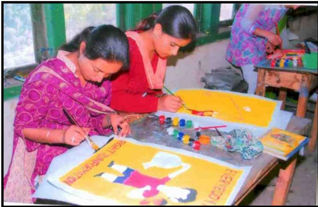
Students at work in Poster making on RTI