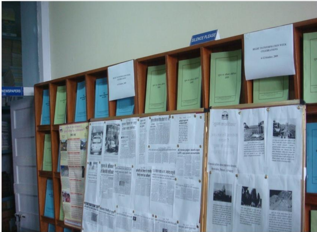
Exhibition of news clippings on RTI