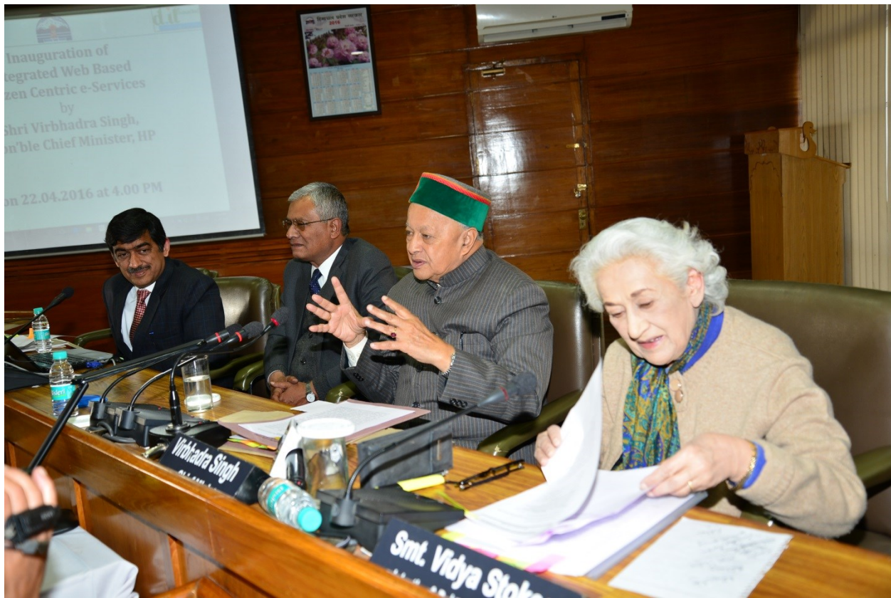
Sh. Virbhadhra Singh, Chief Minister addressing the gathering. Also seen in the picture are Smt. Vidya Stokes, Minister for IT, Sh. P Mitra, Chief Secretary and Sh. Sanjeev Gupta, Additional Chief Secretary (IT), Himachal Pradesh

Shri Virbhadra Singh, Hon'ble Chief Minister Himachal Pradesh, formally launched twenty web based Citizen Centric Services on 22 nd April, 2016 under e-District project. This launch has not only digitally empowered people of the state but was also the first step towards integration of various departmental databases and delivery of services under single sign on. The services launched under e-District includes Registration and Renewal of shop and commercial establishment, registration of establishment employing contract labour, application for contract labour license and 14 kind of certificates including rural area, backward area, legal heir, backward area, minority community, agriculturist, Dogra class, character, caste, bonafide Himahali, income, OBC, freedom fighter, domicile and needy person. With this the total number of services available under e-District has reached 31 which ranks the state among top five states in the country.