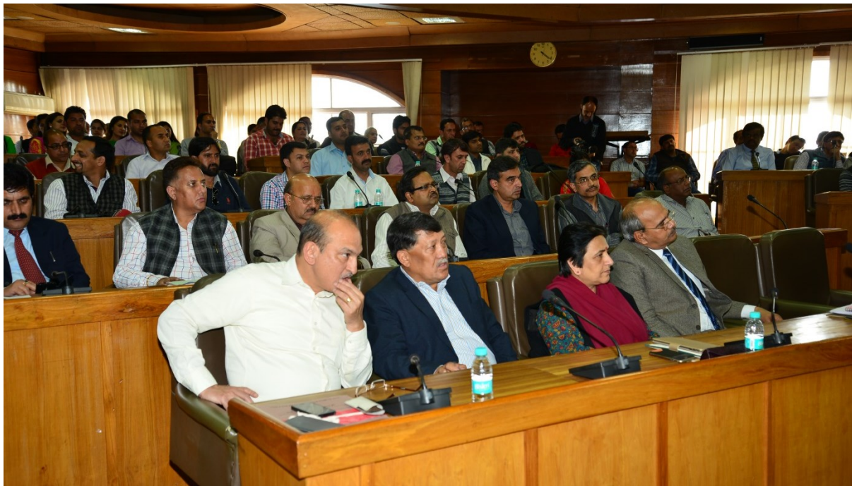
Additional Chief Secretaries & Secretaries of various departments of Himachal Pradesh present on the occasion.

On this occasion, the CM appreciated the efforts and congratulated the state Information Technology department, National Informatics Centre, System Integrators as well as all concerned departments who worked together and made the state proud in the field of Information Technology. Chief Minister also mentioned about the availability of 53 services under single roof through more than 2000 Lok Mitra Kendras which are available at Panchayat level.